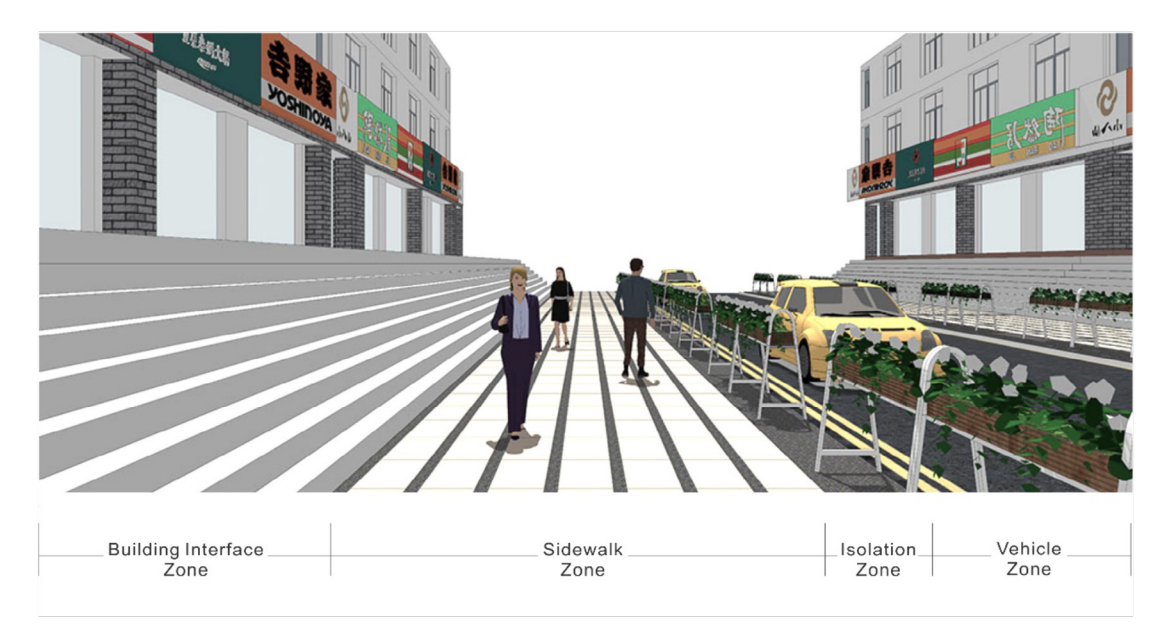
Figure 2. Street partition zones of simulated streetscape picture